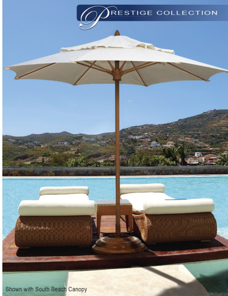
Shown with South Beach Canopy