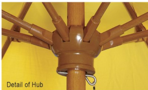
Detail of Hub