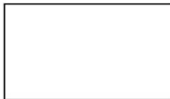
TOP VIEW OF LEFT HAND 16" SEAT PLANK

THE HOLES LINE UP AS SHOWN HERE. OUTSIDE HOLES USED TO ATTACH PLANK TO SEAT PLATE.