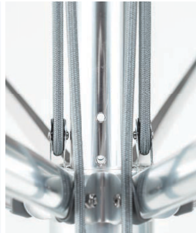
COMMERCIAL DOUBLE PULLEY SYSTEM