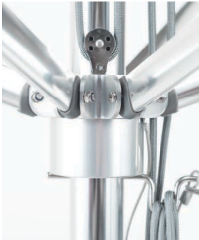
POLISHED SILVER ANODIZED ALUMINUM FINISH