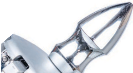
Standard: VERTEX FINIAL