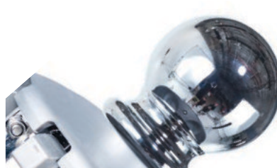
Optional: CLASSIC BALL FINIAL