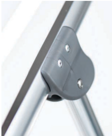
HIGH IMPACT POLYMER JOINTS AND EXTRUDED ALUMINUM RIBS